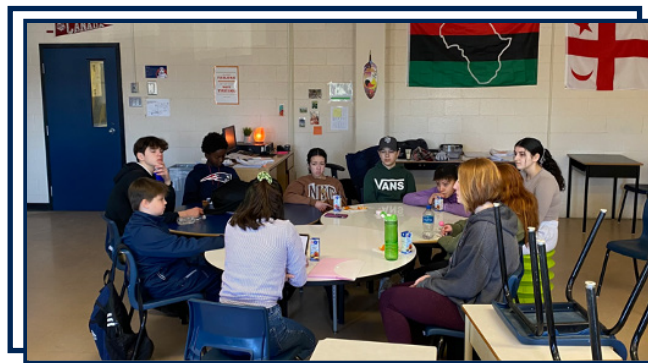
(Student Action Team students doing a focus group session)

“ I think STOMP is important because we are able to give more information about vaping that students may not be aware of. I also like being part of this group because it is fun, and I get to present to other students! ” - Grade 7 Student