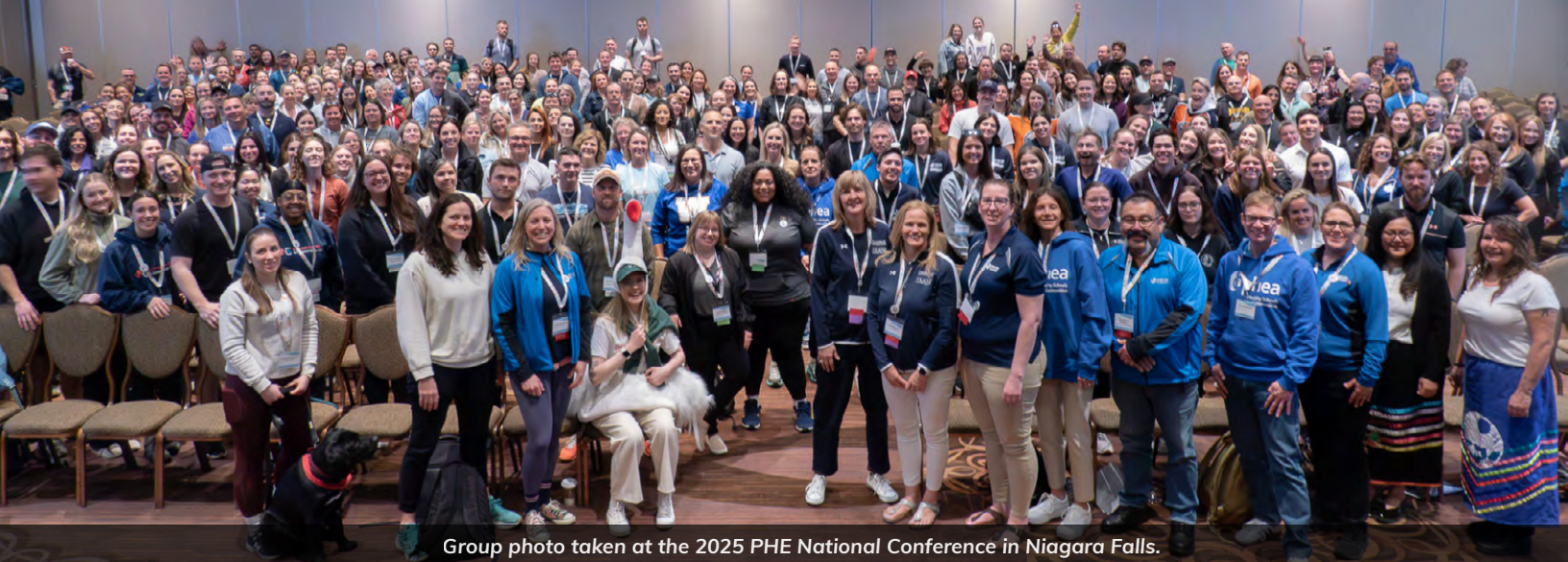
Group photo taken at the 2025 PHE National Conference in Niagara Falls.