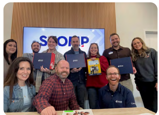
Photos from STOMP workshops in the Anglophone East School District.