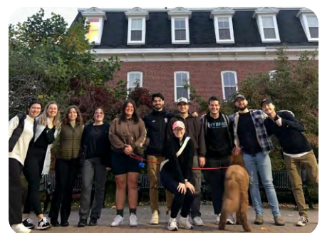
StFX Student Chapter