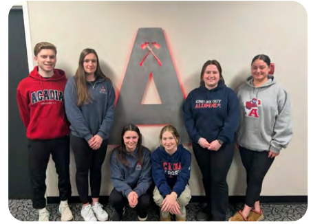
Acadia U Student Chapter