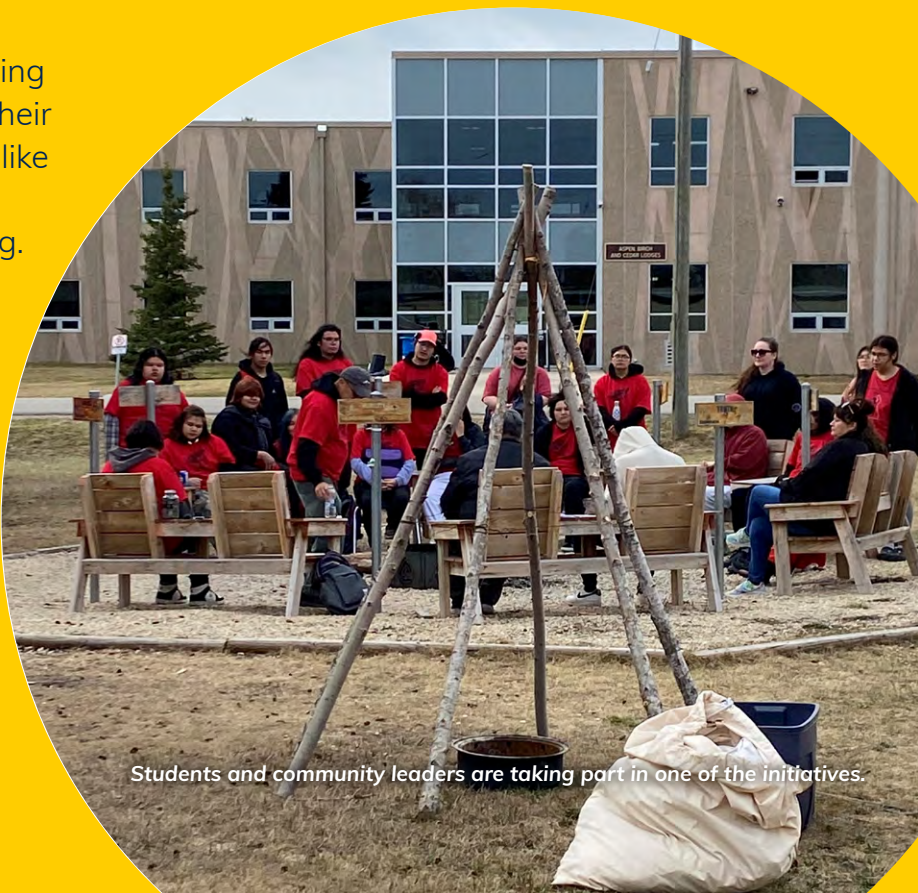
Students and community leaders are taking part in one of the initiatives.