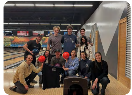
uVic Student Chapter