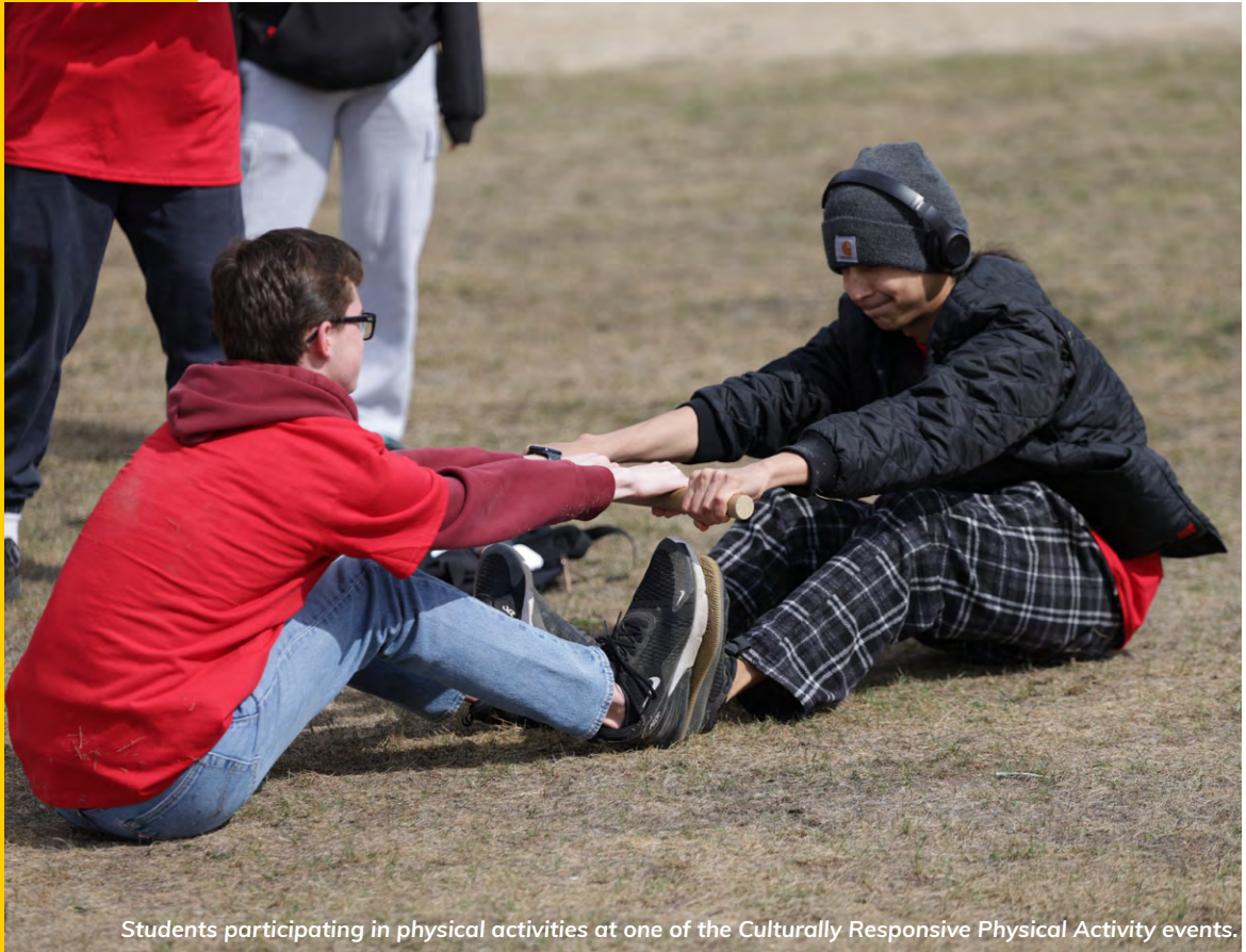
Students participating in physical activities at one of the Culturally Responsive Physical Activity events.