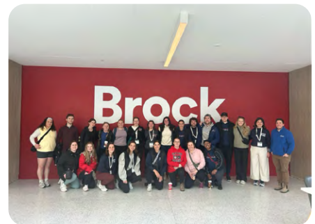
Brock U Student Chapter