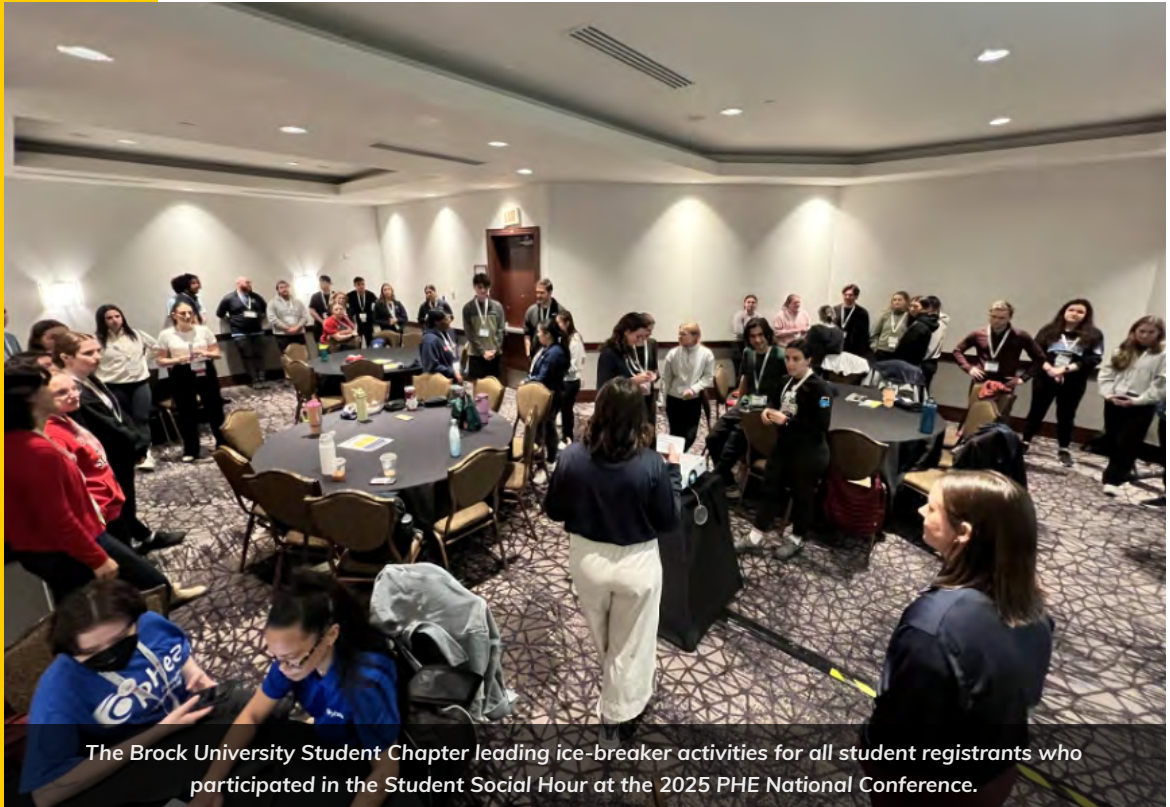
The Brock University Student Chapter leading ice-breaker activities for all student registrants who participated in the Student Social Hour at the 2025 PHE National Conference.