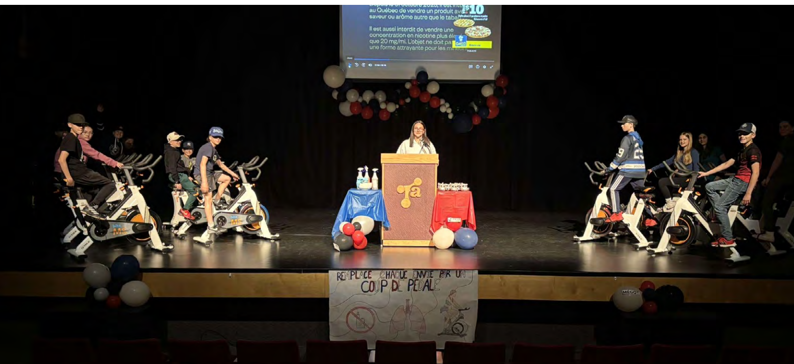
One school's STOMP initiative encourages students to replace vaping with physical activity.