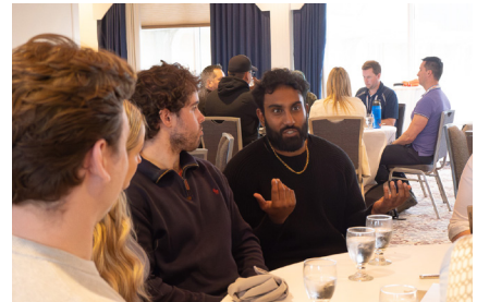
Photo: Group discussion at the 2024 Thinkers Gathering.

To understand and address the challenges boys and young men face, it was essential to first examine what the research reveals about their struggles and the factors driving these issues. By exploring the research on the intersection of societal expectations, cultural norms, and individual experiences, we were able to gain valuable insights into how these dynamics affect their well-being. In doing so, this